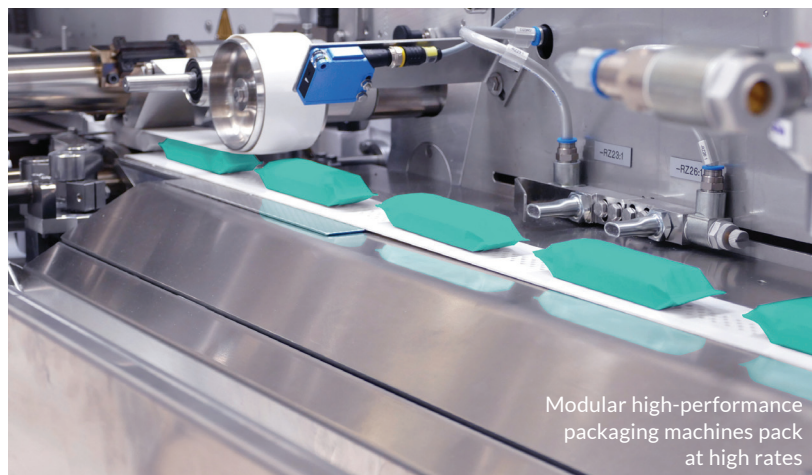
Modular high-performance packaging machines pack at high rates

Theegarden also unveiled the CHS, its modular high-performance packaging machine for chocolate products featuring the complex “envelope fold” packaging type. Small chocolate pralines are packed effectively at a rate of 800 products per minute. But the CHS is particularly flexible when it comes to the nine types of wrapping style it can handle: double twist, protected twist, top twist, side twist, foil wrap, bottom fold, side fold, >>