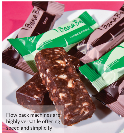
Flow pack machines are highly versatile offering speed and simplicity

“Ulma packaging process consists of a flow pack machine that prepares the packaging. Unlike traditional flow pack packaging which is completely sealed using a lengthwise seal or two crosswise seals, our equipment leaves the