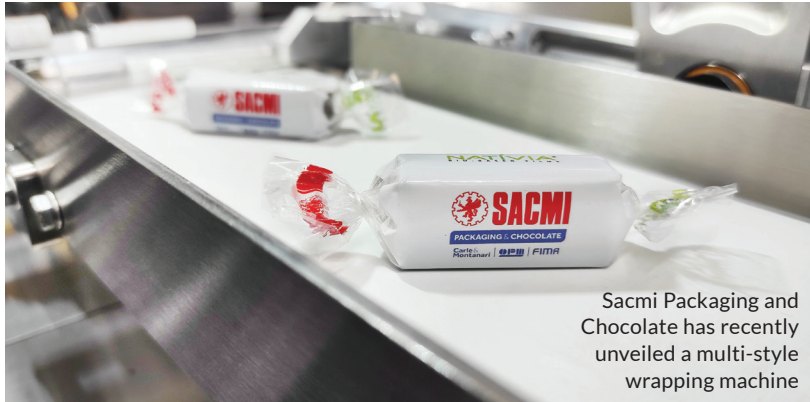
Sacmi Packaging and Chocolate has recently unveiled a multi-style wrapping machine

Machines can be adapted to wrap irregularly shaped products