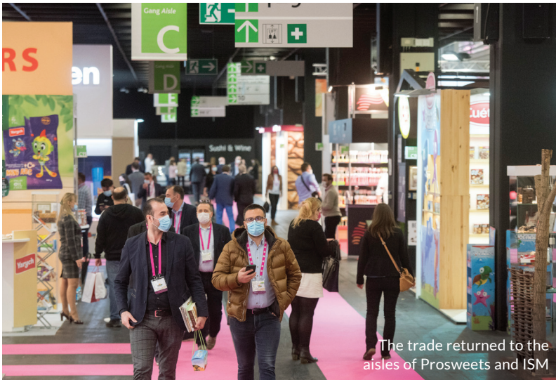
The trade returned to the aisles of Prosweets and ISM