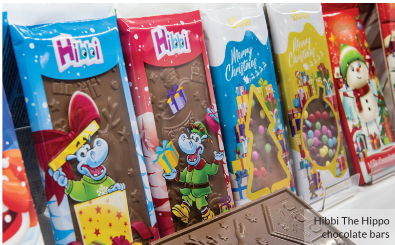
Hibbi The Hippo chocolate bars

“The system under the arle & Montanari brands offers an output of 700 pralines per minute and master formats’ change easily. The individual servo-driven parts of the folding unit can be adapted to praline shape and wrap very delicate or irregularly shaped products.