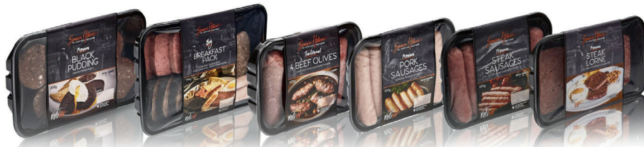
Above: More than a third of linerless labels globally go into wrap and sleeve packaging for food

Sticking to themselves, and so avoiding waste, linerless labels are emerging players in the packaging market. But are they worth the hype, or are they just the latest marketing fad from the label industry? Dominique Huret attended an Alexander Watson Associates seminar to find out