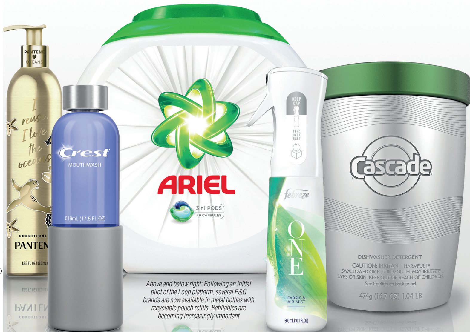
Above and below right: Following an initial pilot of the Loop platform, several P&G brands are now available in metal bottles with recyclable pouch refills. Refillables are becoming increasingly important

Two recent packaging innovations are good illustrations of the P&G strategy. The Lenor Ultra concentrated laundry detergent launched in February in the UK features a floatable sleeve with double perforation to allow its easy removal, decoupling decoration from the bottle body. The use of floatable sleeves, inks that do not bleed, and a clear or light blue bottle are critical to the conditional approval obtained from the European PET Bottle Platform.